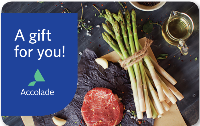
Gatefold Brochure Interior with CTA Card

Visit info.accolade.com/meals.html to get a free week of meals for you and lunch for your team!